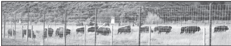
Captured wild bison in quarantine

For more sensible, feasible solutions to the slaughter and harassment of America's last wild bison please visit: www.buffalofieldcampaign.org/actnow/solutions.html