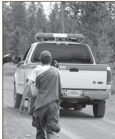
BFC stands every day to document harassment of the bison.