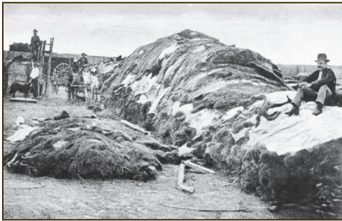
A stack of 40,000 buffalo hides in 1878 shows the enormity of the 19th century slaughter.

The wild buffalo of the Greater Yellowstone Ecosystem (GYE) are the last genetically pure remnant of the great herds of millions that once thundered across the American plains. Descended from just 23 buffalo that survived the 19th century slaughter, they are the only buffalo to continuously occupy their native habitat. Wild and unfenced, this unique population holds the key to the future of wild buffalo in America.