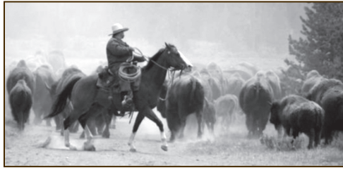
Mad cowboy disease – hazing bison off public land