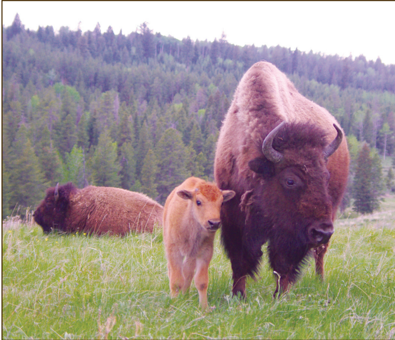
A few of the many wild bison spared from slaughter this past spring