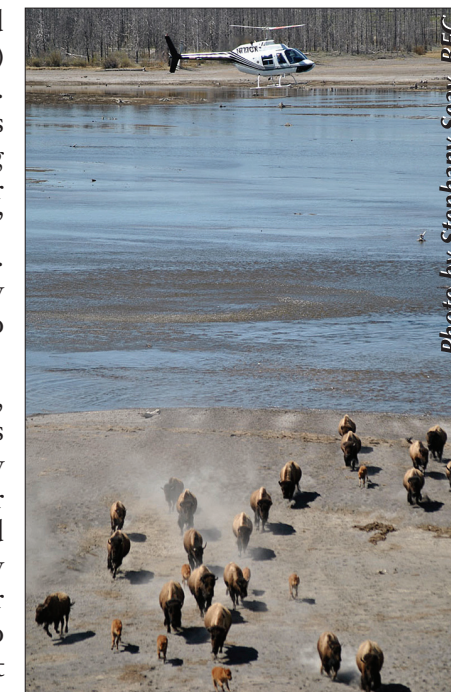
A helicopter hazes newborn calves and their families from Gallatin National Forest lands, public lands that never host any cattle.