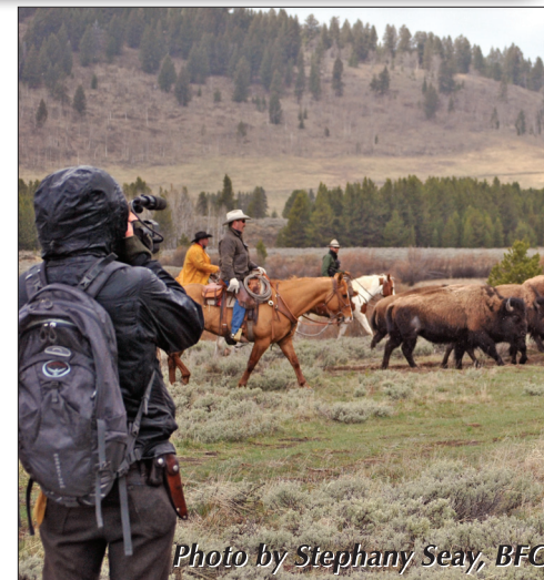
BFC's all-volunteer patrols stand with the buffalo every day documenting agency harassment.