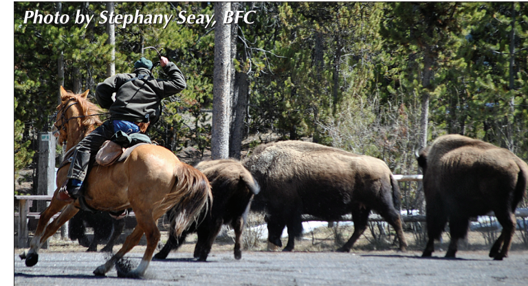
The local Montana Fish, Wildlife & Parks game warden aggressively chases buffalo through a public campground.