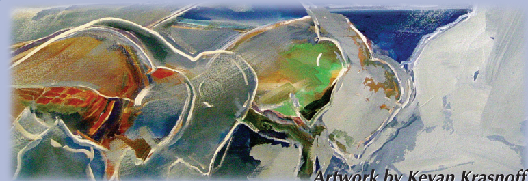
Artwork by Kevan Krasnoff

Buffalo Field Campaign works in the field and on the policy front year-round to stop the slaughter and harassment of native bison. BFC is the leading source of news, information, and activism on wild buffalo and the dangers of the current government plan. Donations keep BFC patrols in the field and the pressure on the government to abandon the failed Interagency Bison Management Plan in favor of a vision that recognizes and protects the United States' only continuously wild population of bison. BFC relies on our grassroots network of supporters to take action for the buffalo and contribute to our work. Please use the enclosed envelope or visit BFC's website to make a tax-deductible contribution or merchandise purchase. We cannot help the buffalo without you. Thank you! ❶