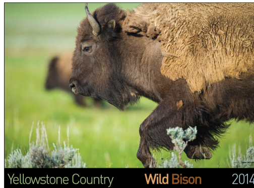
Yellowstone Country Wild Bison 2014